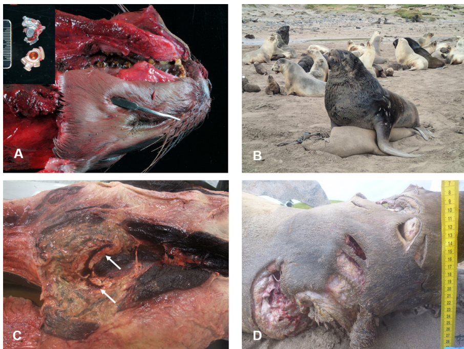
Fig. 3. Representative examples of gross lesions for different causes of mortality. A. Anthropogenic trauma. This juvenile female from mainland New Zealand was killed by gunshot. Inset shows retrieved bullet fragments. B. Conspecific trauma. A mature adult male attempting to mate a dead female on Enderby Island. C. Infection: cellulitis and abscessation in the neck of a juvenile male sea lion. A beta-haemolytic Streptococcus spp was cultured from the necrotic soft tissue, and M. pinnipedii was cultured from the lymph node (white arrows). D. Predation. Shark bite wounds in the dorsal pelvic region of an Enderby Island adult female.

undertaken, with the following reasons given: extensive scavenging ( n = 4 ), decomposition ( n = 2 ), animal too large and in a dangerous location ( n = 1 ) or no recorded reason ( n = 6 ).