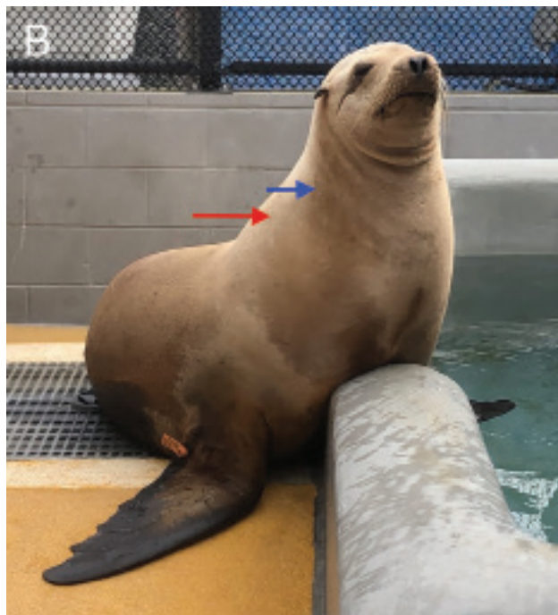
Figure 2 —Photographs of 2 stranded CSLs examined at The Marine Mammal Center. A—An adult female CSL with Sarcocystis infection; notice the marked atrophy of muscle and fat. B—An adult female CSL with signs of domoic acid toxicosis and normal body condition. The approximate locations for collection of biopsy specimens from the supraspinatus muscle over the scapula (red arrow) and the sternocleidomastoid muscle in the cervical region (blue arrow) are indicated.