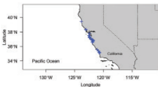
Figure 1 —Location of stranding for 38 California sea lions (CSLs; Zalophus californianus ) with Sarcocystis -associated polyphasic rhabdomyositis examined at The Marine Mammal Center in Sausalito, California, between September 1, 2015, and December 1, 2017.

On admission, animals were weak and emaciated and often had severe, generalized muscle atrophy. The vertebrae, scapulae, ribs, and pelvic bones were typically visible, and atrophy of the temporalis and masseter muscles was particularly pronounced, giving the animals marked cranial angularity with prominent zygomatic arches, sagittal and occipital crests, and mandibular rami ( Figure 2; Table 1 ). Twenty-five animals had clinical signs of respiratory disease, including dyspnea, coughing, and increased larynge-